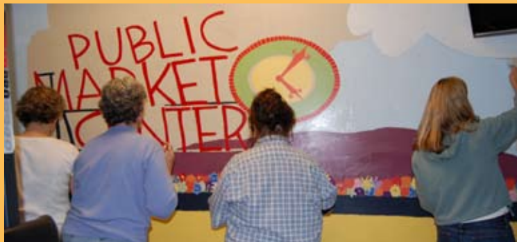
Volunteers from Chateau Ste. Michelle paint a mural of regional scenes for the fitness room in House A