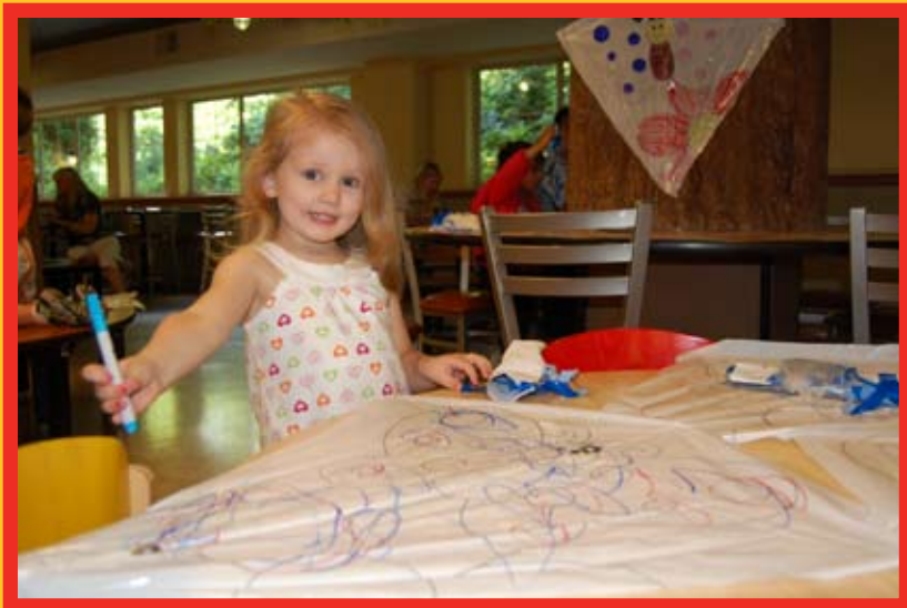
Kite-making is loads of fun with lots of pretty colors to use

To say that volunteers are the heart of the House is an understatement. Volunteers help the families in all ways, large and small. They clean, cook, bring therapy dogs to visit, pull weeds, plant flowers, bake cookies, host movie nights, drive vans on shopping expeditions, run food drives and so much more.